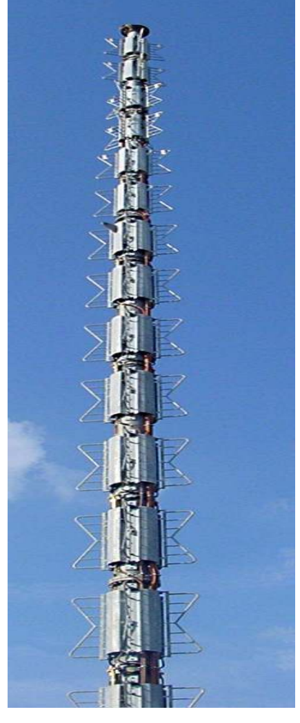
Fig. 1 Horizontally polarized Superturnstile array

The Superturnstile is generally employed as an omnidirectional (Fig 2), or occasionally a figure eight, horizontally polarized transmitting antenna and provides excellent and reliable service in the Low, Mid and High Bands. Most frequently used as a medium power single channel antenna we also offer custom designs for two or even three channel operation. The antenna is equally suited to both analogue and digital transmissions.